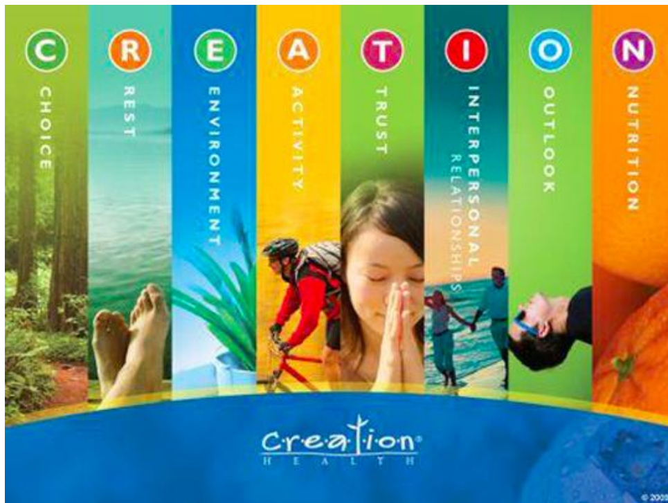
Figure 2. CREATION Health Model, © 2011 by Adventist Health System (CREATION Health is a whole-person wellness program and philosophy.)

One of the nursing role components taught across all levels of nursing curriculum at Southern is that of health promotion—educating and empowering individuals, families, and communities to make lifestyle choices that prevent disease, improve well-being, and actualize health potential. A primary framework for teaching health promotion concepts is the CREATION Health model (see Figure 2). Although not specific to nursing, CREATION Health “is a lifestyle transformation curriculum designed with a holistic approach to mental, physical and spiritual well-being” (“Welcome,” n.d.).