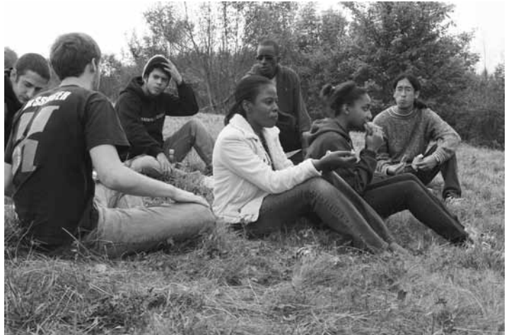
Waiting for birds at Whigg's Meadow.