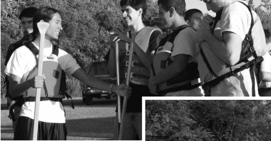
Canoeing out to the Bat Cave on Nickajack Lake.

“Wow! I can’t believe there are so many of them.” “Oh, look over there! This is so cool.” Those are just a couple of examples of the exclamations heard as students (and faculty) gathered as near as possible to the mouth of the cave. This was a canoe trip on a portion of Nickajack Lake leading to the twilight observation of thousands of grey bats leaving the cave for their nightly excursion.