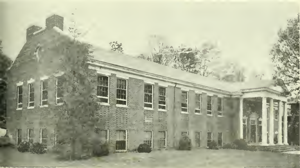
Hackman Science Hall, Southern Missionary College

Yes, you will want to come back home and see at first hand the present and proposed developments since you last viewed Southern Missionary College. A royal welcome awaits you here at your college. Put a circle around the date, May 3-4, and "Come on down to Collegedale."