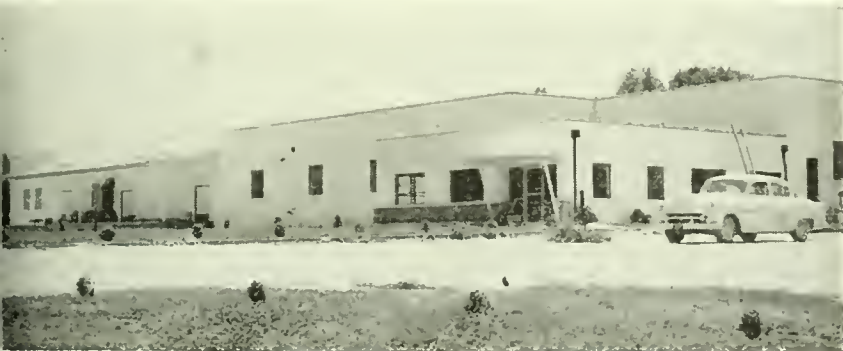
THE NEW KING'S BAKERY