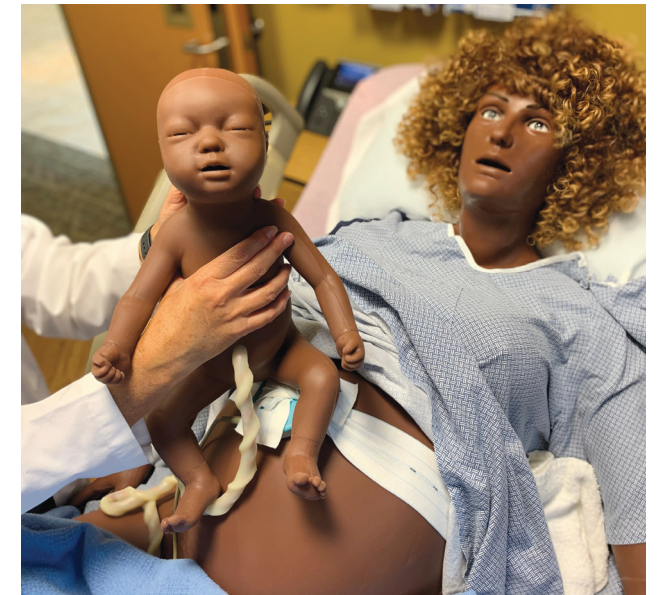
Simulation manikin "Victoria" and her baby

Victoria will prove extremely valuable to students who are practicing women's healthcare. The nurse practitioner students will be able to participate in simulated patient care scenarios where they can practice female exams and place intrauterine devices (IUDs) while interacting with the manikin.