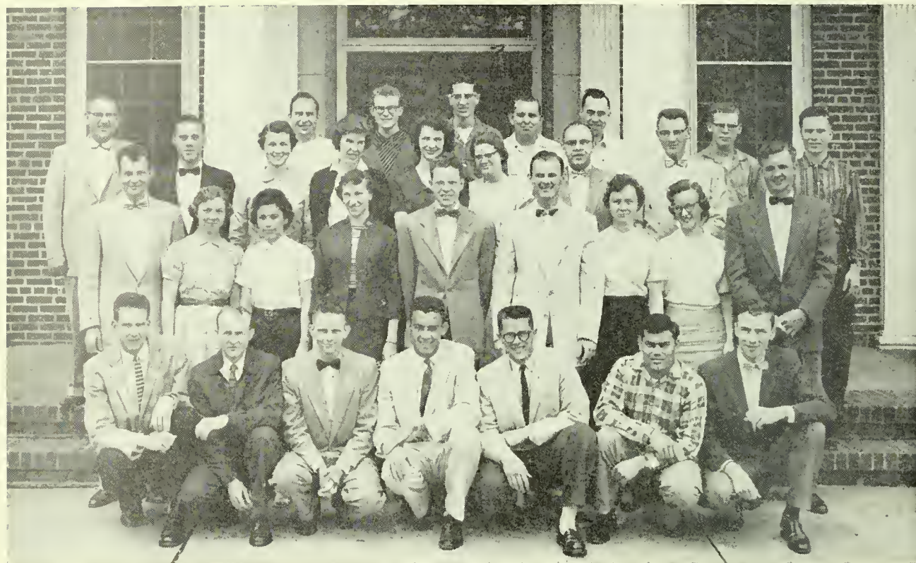
Class of 1958