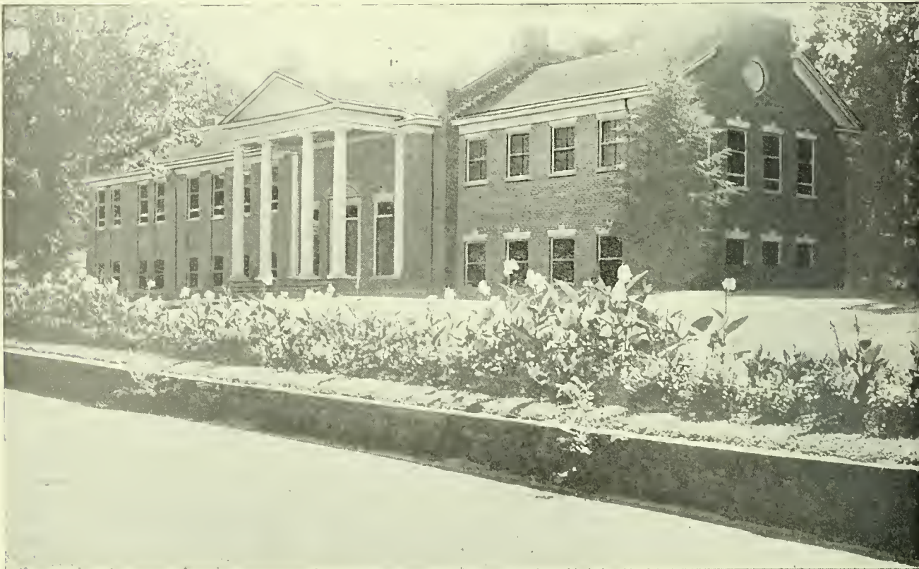
Hackman Hall of Science