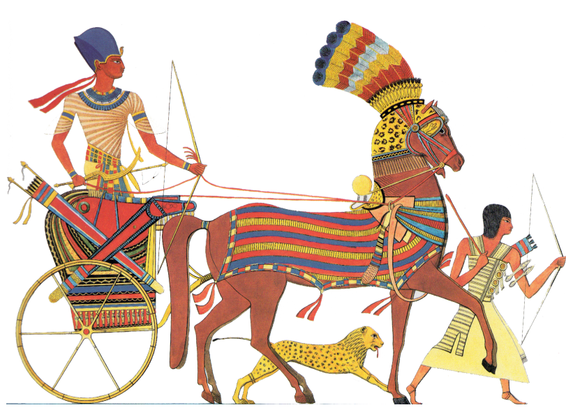
A battle ready Ramesses II riding a war chariot, preceeded by an archer. Illustration by Ippolito Rosellini from the Abu Simbel temple.