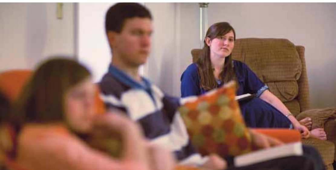
Life Groups provide Southern students with a safe place to share and grow spiritually.

“My goal for my group is that everyone who attends will take their relationship with God more seriously,”