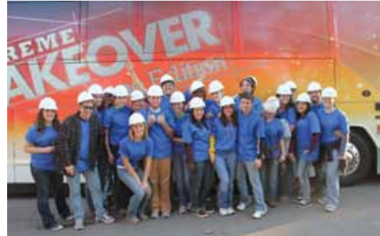
Students were proud to represent Southern's values as volunteers on Extreme Makeover: Home Edition.

For all involved there was a sense of uniting for a great cause, something