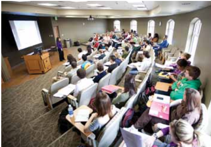
Students attend a lecture in one of Florida Hospital Hall's state-of-the-art classrooms.

With resources that support an easy transition from classroom to workplace, the School of Nursing can continue to produce quality nurses. And with more