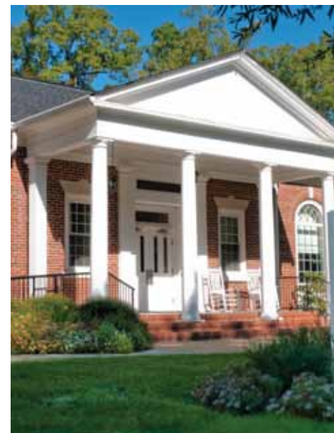
Daniells Hall is the home of the School of Social Work.