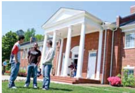
Students outside Hackman Hall, the home of the School of Religion.

dent should have the opportunity to take a class that expounds on how to grow and develop a relationship with Jesus—to know Him as their personal Lord and Savior. By developing this friendship with