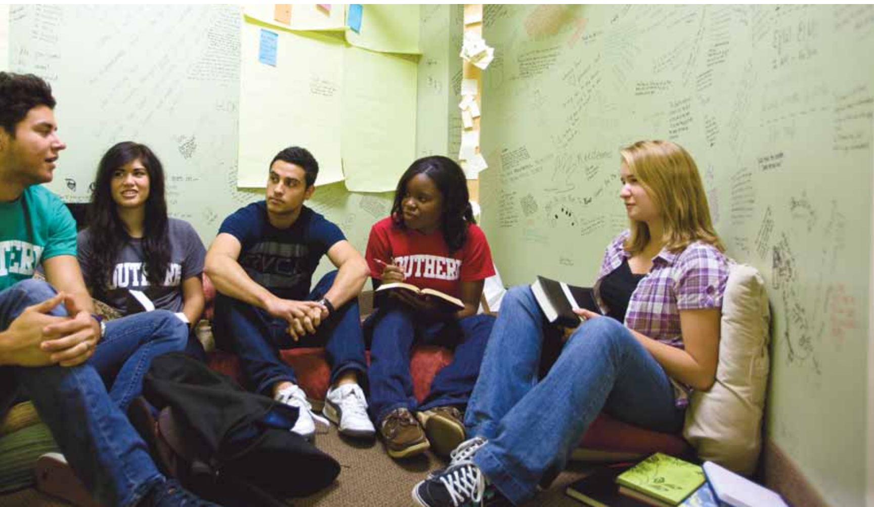
Southern's Life Groups all share one common goal: to make God relevant to students' lives.