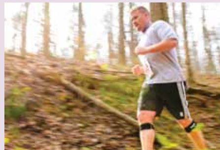
A competitor takes part in the annual Southern 6 race on the Biology Trail.