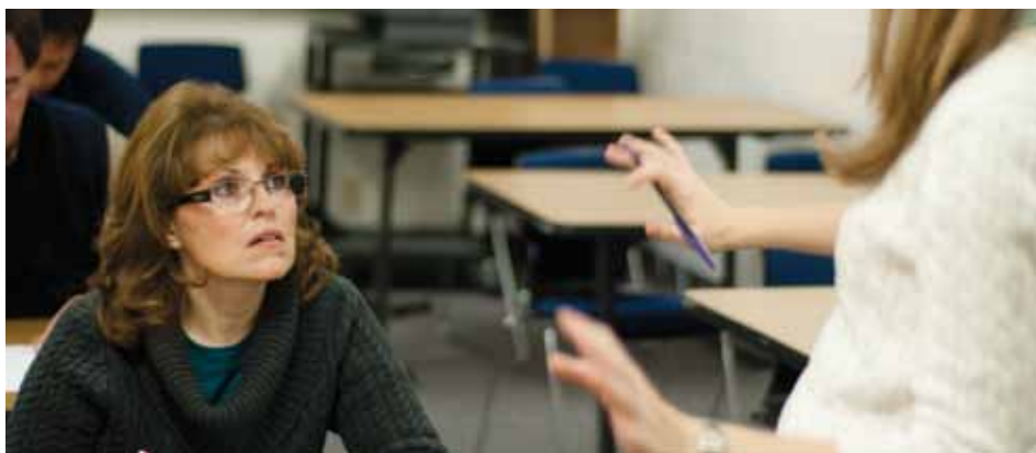
The Argentinean delegation received valuable instruction and experienced Southern’s culture of hospitality.