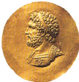
Philip II of Macedon

The Lynn H. Wood Archaeological Museum announces the development of a new exhibit, "Faces of Power: Ancient Coins from the Biblical World," brought about by the reception of a rare coin collection from the Bechtel family.