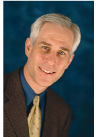
Director, Institute of Archaeology