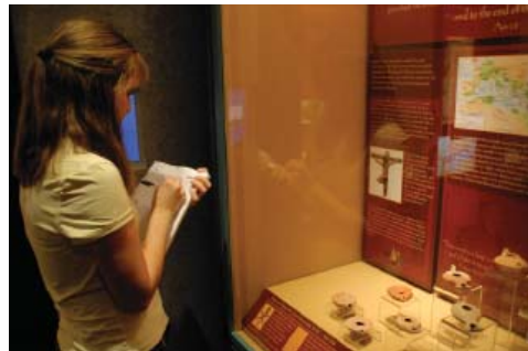
Student studies at the museum

Archaeology students at Southern have free access to several educational resources. The Lynn H. Wood Archaeological Museum is home to the prestigious William G. Dever Near Eastern Collection which is comprised of more than 200 artifacts and over 300 ceramic sherds (pieces). This unique teaching collection is an invaluable instructional resource for the student of archaeology. The museum's laboratory facilities serve as a basis for teaching pottery typology, ceramic conservation, and artifact cataloging and accession. Today this