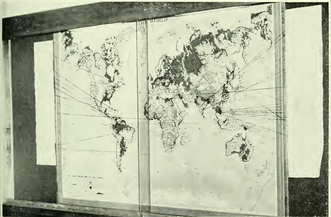
Map Showing Alumni in Mission Service, Class Gift 1962.