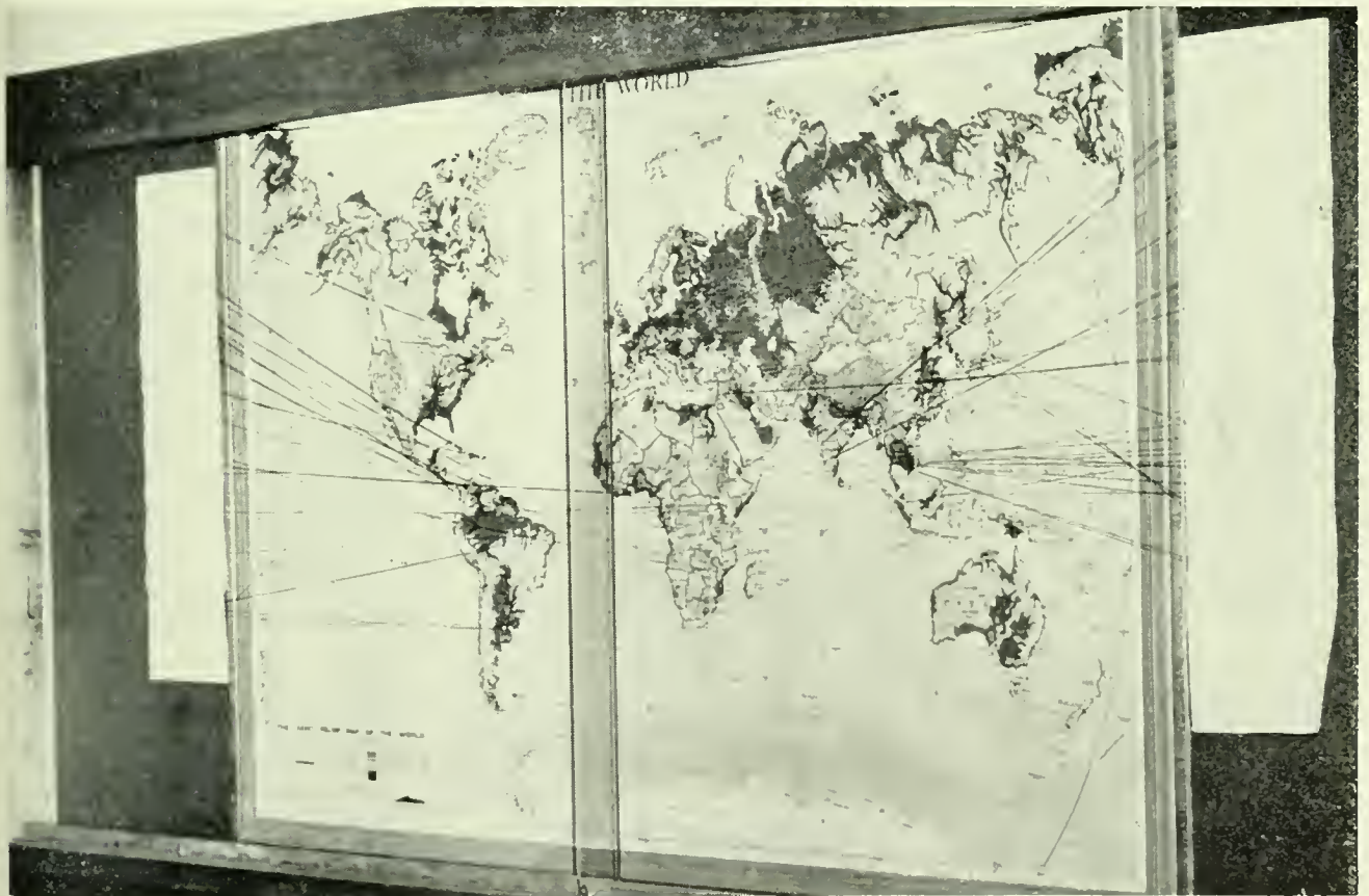
Map Showing Alumni in Mission Service, Class Gift 1962.