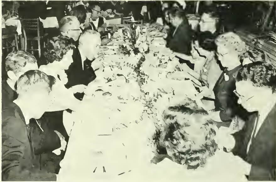
The Honor Classes of 1939 and 1954 enjoy supper in the college dining hall. This view is taken from one end of the table.