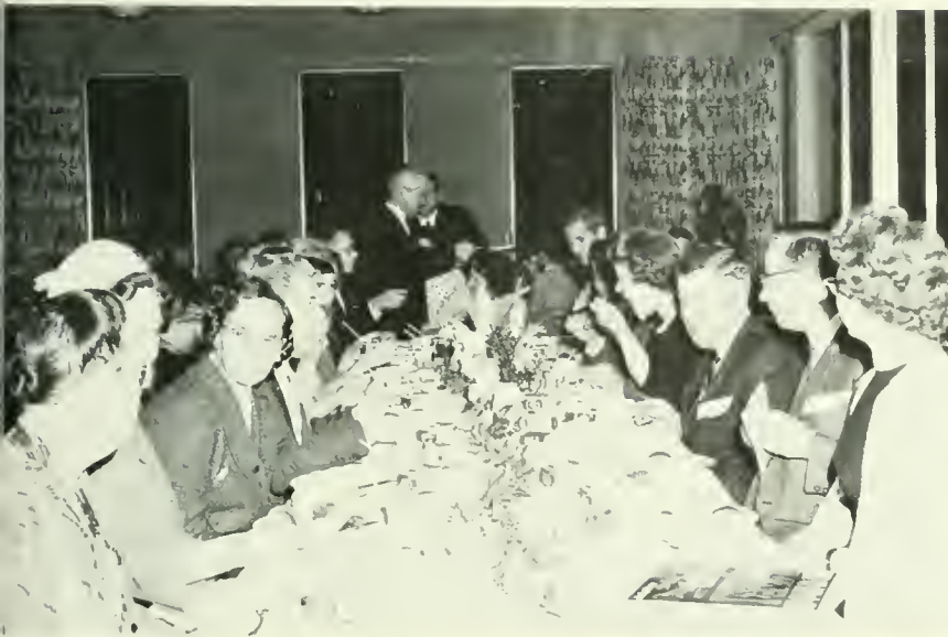
The view from the other end of the table shows the rest of the Honor Classes of 1939 and 1954 that were present.