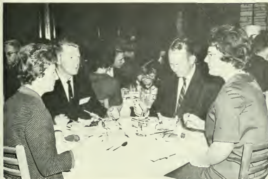
Friends and classmates met for supper and talked about "when we were at SMC . . ."