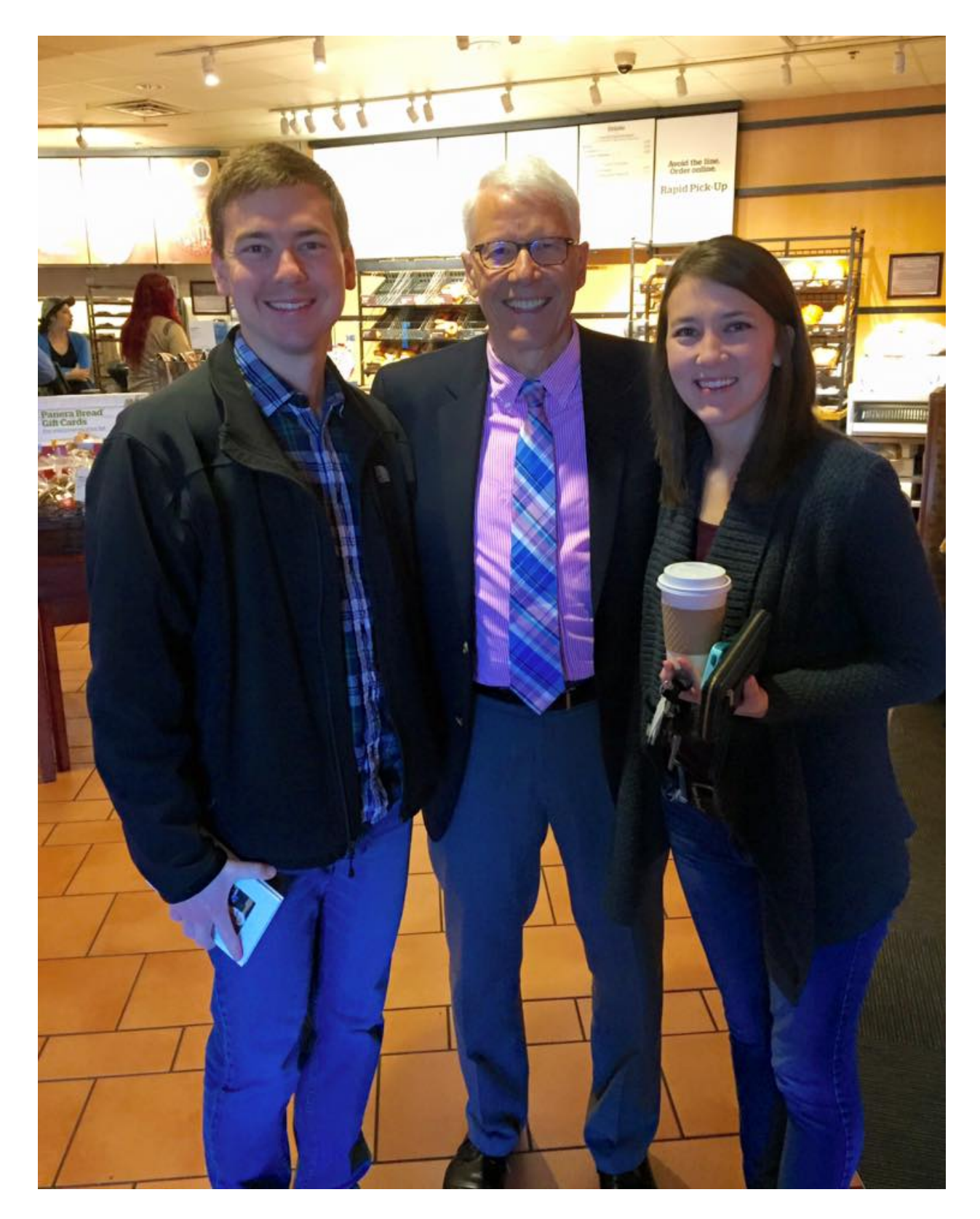
Like the <u>Alumni Facebook</u> page and look for similar events throughout the country in the near future!