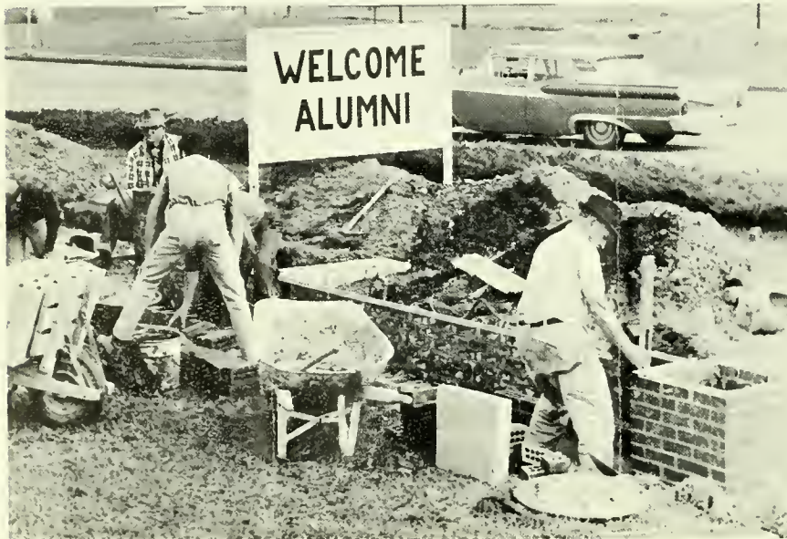
A temporary welcome sign was erected on the site of the new entrance sign, presently under construction. The new sign is a gift of the Alumni Association.