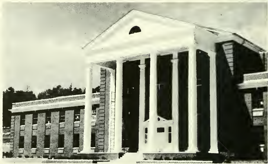
Personnel moves into new Administration Building.