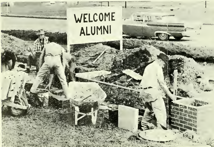
A temporary welcome sign was erected on the site of the new entrance sign, presently under construction. The new sign is a gift of the Alumni Association.