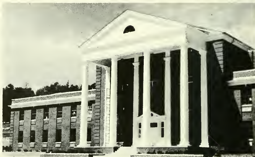
Personnel moves into new Administration Building.