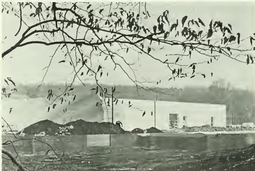
The walls are up, and soon the roof will go on the new College Broom Shop, sponsored by SMC's Committee of 100.