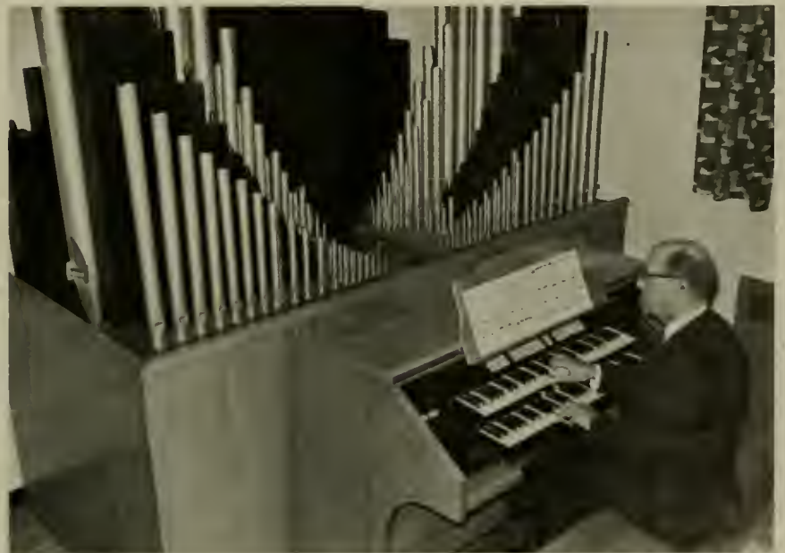
. . . and in his studio.

There are 26 foreign countries represented in the accepted list of students. There are 915 students already accepted for the College residence halls. The village lists 213 acceptances, and there are 31 accepted for the Orlando campus and 26 for the Madison campus.