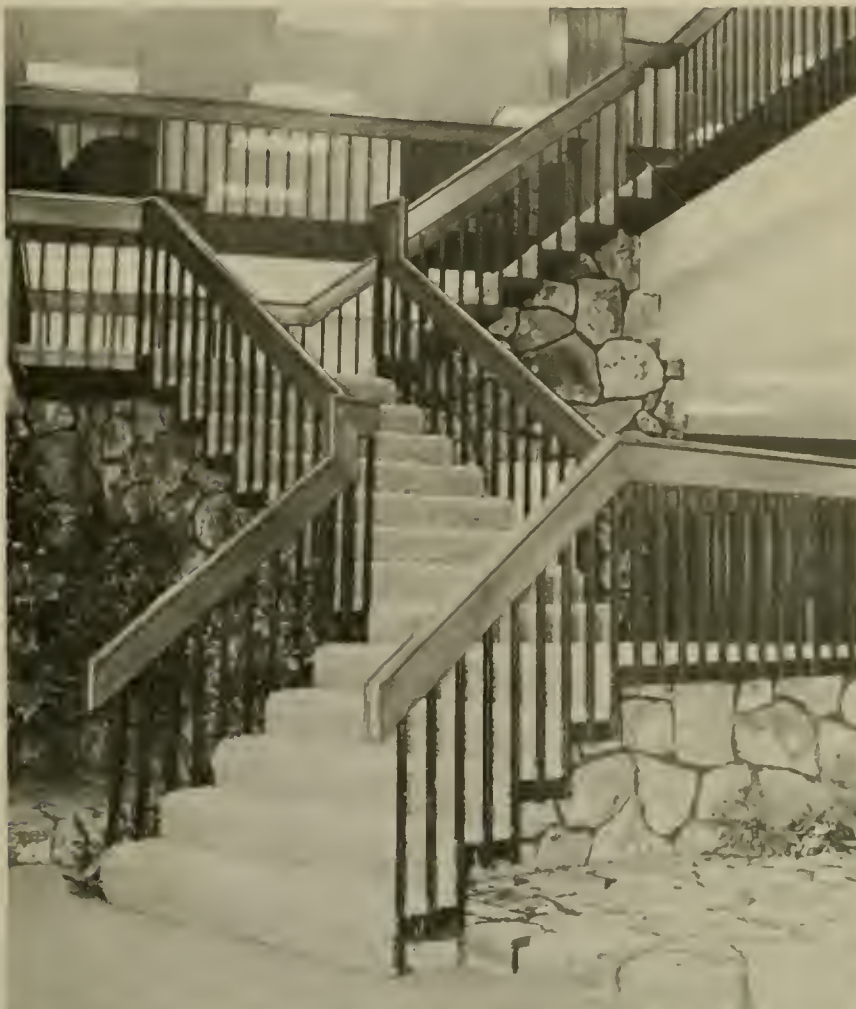
The focal point of the new library is the beautiful stairway to the second floor.