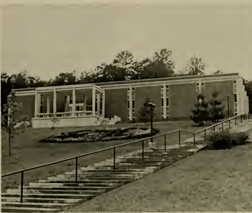
The new library occupies the site of old Talge Hall.