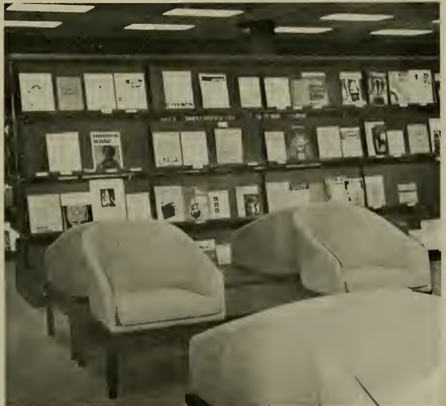
The magazine reading area of the new library is conducive to study.

The old library is now being renovated for occupancy by the Math and Physics Departments and Computer Science.