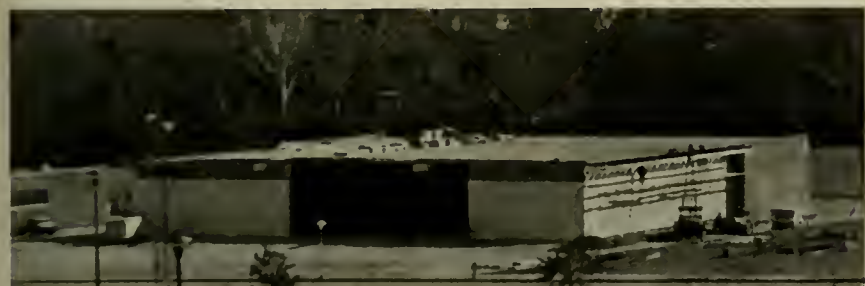
A new super market takes shape as the College Plaza Shopping Center is enlarged at SMC.

Besides offering the usual supermarket fare, the new market will include a delicatessen, health and natural foods section, and the sales outlet for the college bakery, which will be moved to the new building from its