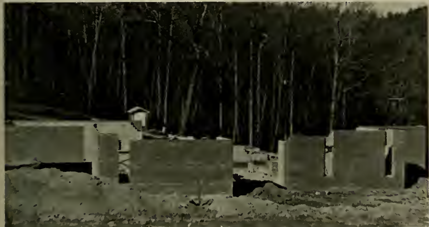
The new Home Economics building is now under construction on the site of the old Collegedale Academy.