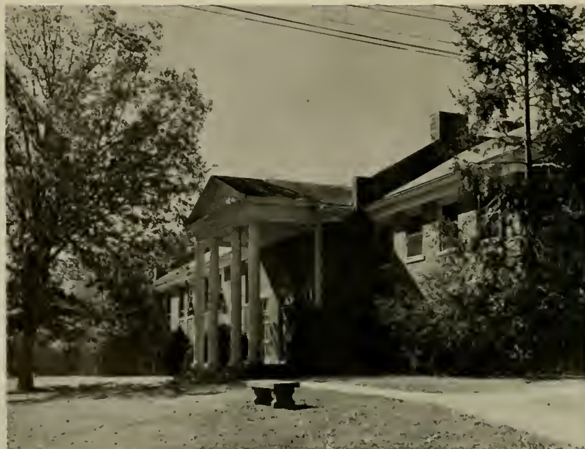
Hackman Hall, formerly housing all the sciences and math, has been remodeled and now has new classrooms and labs for the Chemistry and Biology Departments.