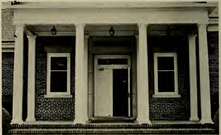
The new computer takes up residence in the recently renovated A. G. Daniells Hall.