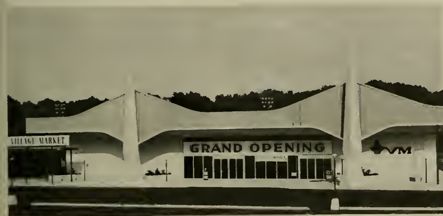
Six hundred people were present at the official opening of the new $350,000 Village Market, and over 1200 customers visited the store that day.