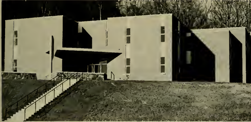
Front view of the new Home Economics Building.