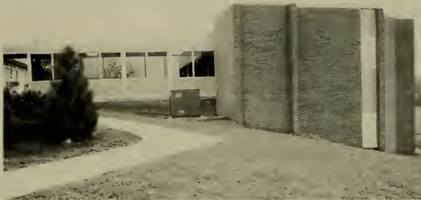
This is the new addition to the Spalding Elementary School, with its four classrooms and four restrooms. It houses the seventh and eighth grades which have two sections each with a total of 120 pupils. On the left is the connecting passage between the old and new parts of the building.