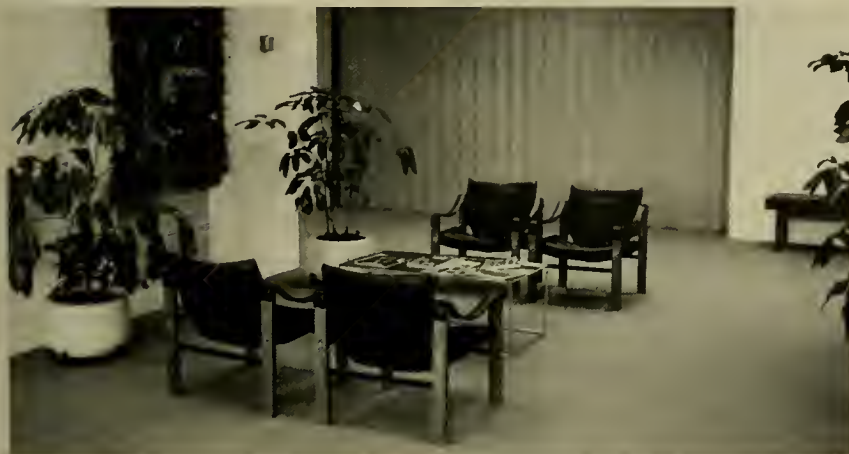
A view of the lobby of the as yet unnamed beautiful new home economics building.

Open house for the new $260,000 home economics center at SMC is set for April 10 to 13. The total cost includes equipment and furnishings.