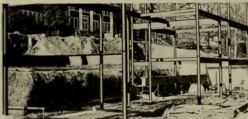
This picture shows the progress on the new cafeteria building which is being erected on the site of the former cafeteria just back of Wright Hall. The old tabernacle houses the food service department until the new one is completed.