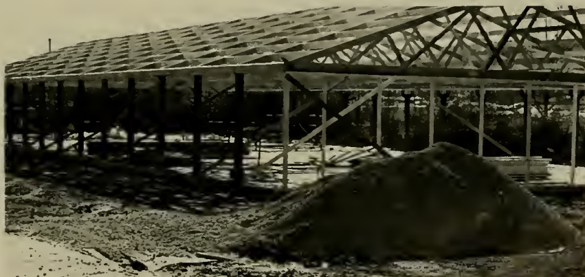
The new greenhouse in which hydroponic tomatoes hopefully will be produced commercially.