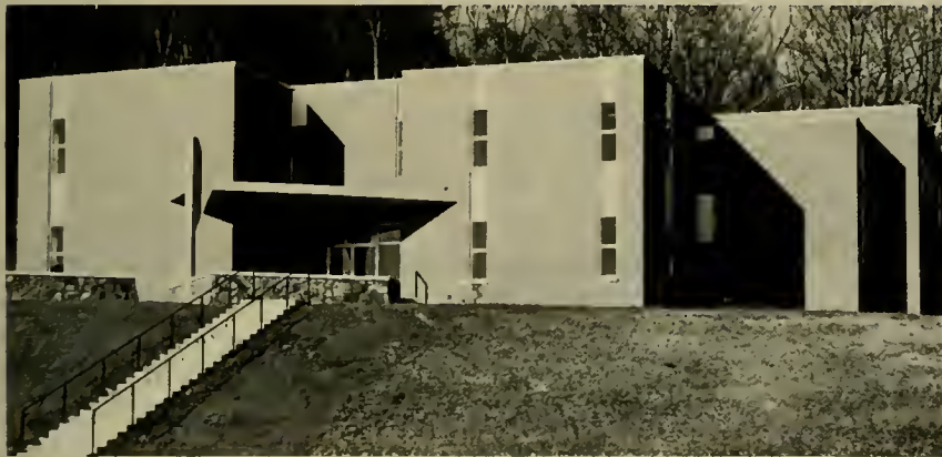
Front view of the new Home Economics Building.