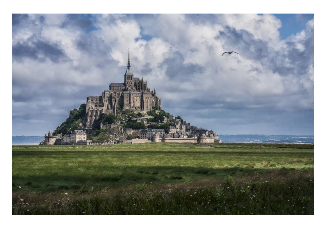
From May 29 to June 10, 2016, we will be visiting Belgium, France, Germany, and Switzerland. The cost is $4,600/person which includes air fare, lodging, ground transportation, sightseeing activities (20 estimated), and breakfasts/suppers.

A $700 deposit is due by the end of December 2015.