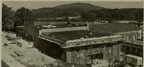
Though the new cafeteria-student center building is not yet finished, it already houses the business administration department with its three classrooms and four offices, with additional space for readers and secretaries; it also houses the Computer Spectrum business, and offices for MV, Temperance, and the Colporteur Club. Grindstone Mountain is seen in the background.