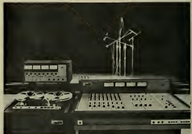
Some of the new audio equipment slated for installation in the new McKee Library Media Arts center.

The new attractive McKee Library presents an advantageous location for housing the new audio-video arts center. The building is open, supervised and accessible to students daily. The atmosphere is conducive to precise, creative work. The space is already air-conditioned, heated, and is being temporarily modified at low cost.