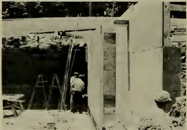
Foundation goes in for new building being financed by SMC's Committee of 100.

During the past few years enrollment of non-degreed elementary teachers has decreased while enrollment of post graduate elementary teachers has increased. This reflects the fact that teachers in the Southern Union have been diligently working toward and earning their degrees at Southern Missionary College, with a resultant upgrading of the Seventh-day Adventist schools of the South.