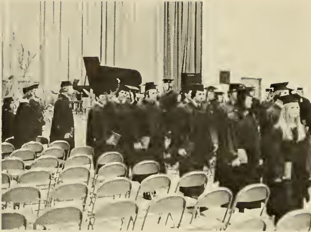
Seniors marching out after graduation at SMC 1975