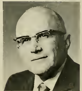
Elder Robert H. Pierson