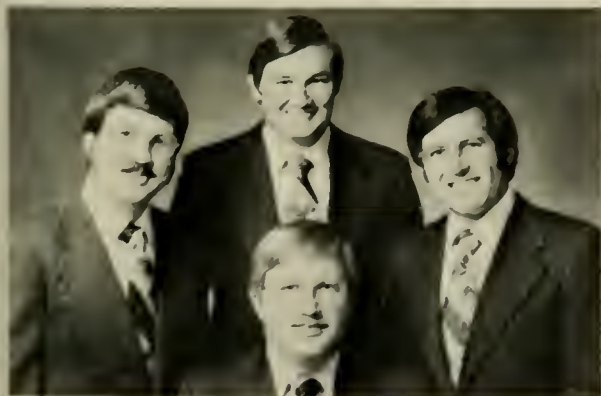
Voice of Prophecy Quartet

Over the past five years the most rapidly growing department on the SMC campus is the nursing divi-