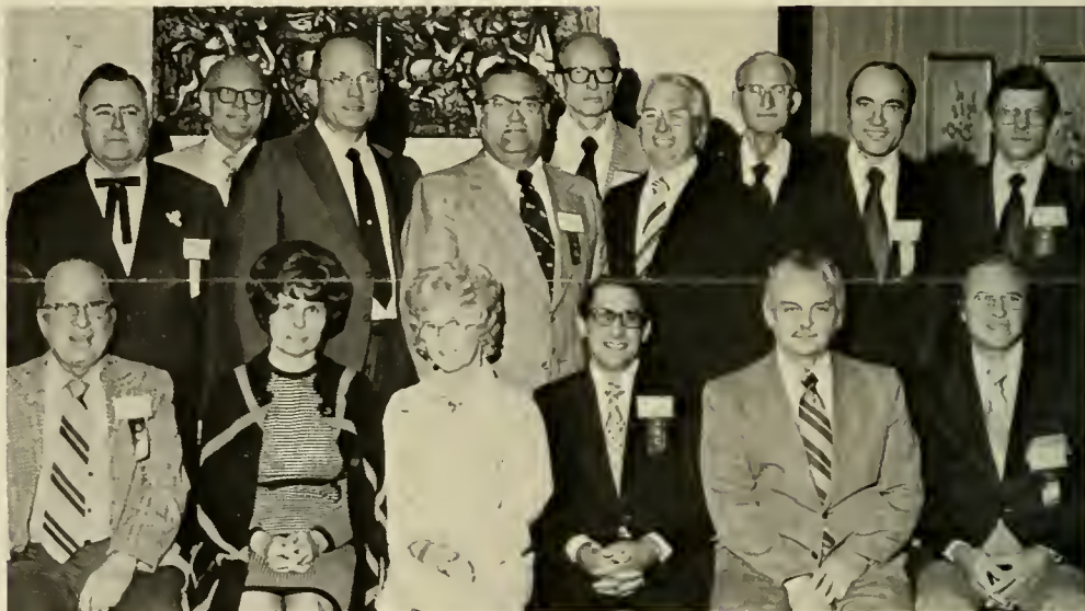
1950 The Twenty-five Year Honor Class