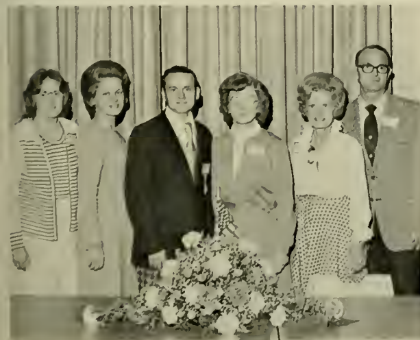
SMC ALUMNI ASSOCIATION OFFICERS FOR 1975-76