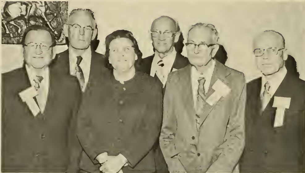
1925 The Fifty-Year Honor Class