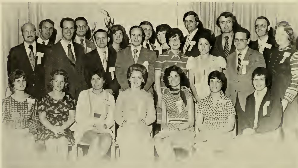
1965 The Ten Year Honor Class