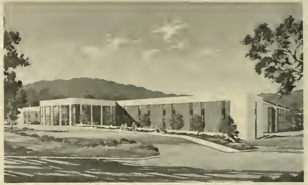
The new addition to Thatcher Hall (women's residence hall) has been started and hopefully will be completed shortly after second semester begins. Jack Tyler and Associates, architects, have submitted this artist's conception of how the new building will look.