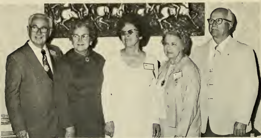
Class of 1926