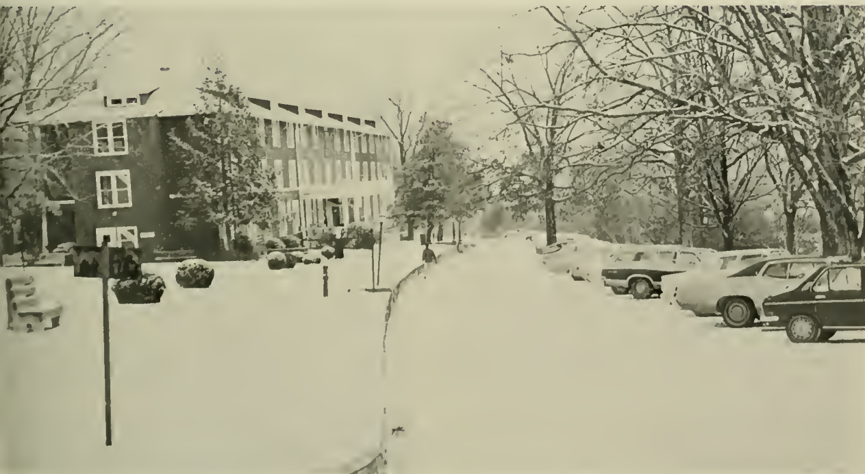
Graduates of SMC have not seen this sight very many times during their stay on campus. This view from Lynn Wood Hall looking toward Maude Jones Hall shows snow-covered roads and sidewalks. The dedicated road crew from General Services Department and Engineering Department cleared paths all over the campus and classes went on as usual.

As this is being written, word came over the wires that this is the coldest winter on record since Colonial times. We know now how the pioneers felt as they trudged over the Appalachian Trail!