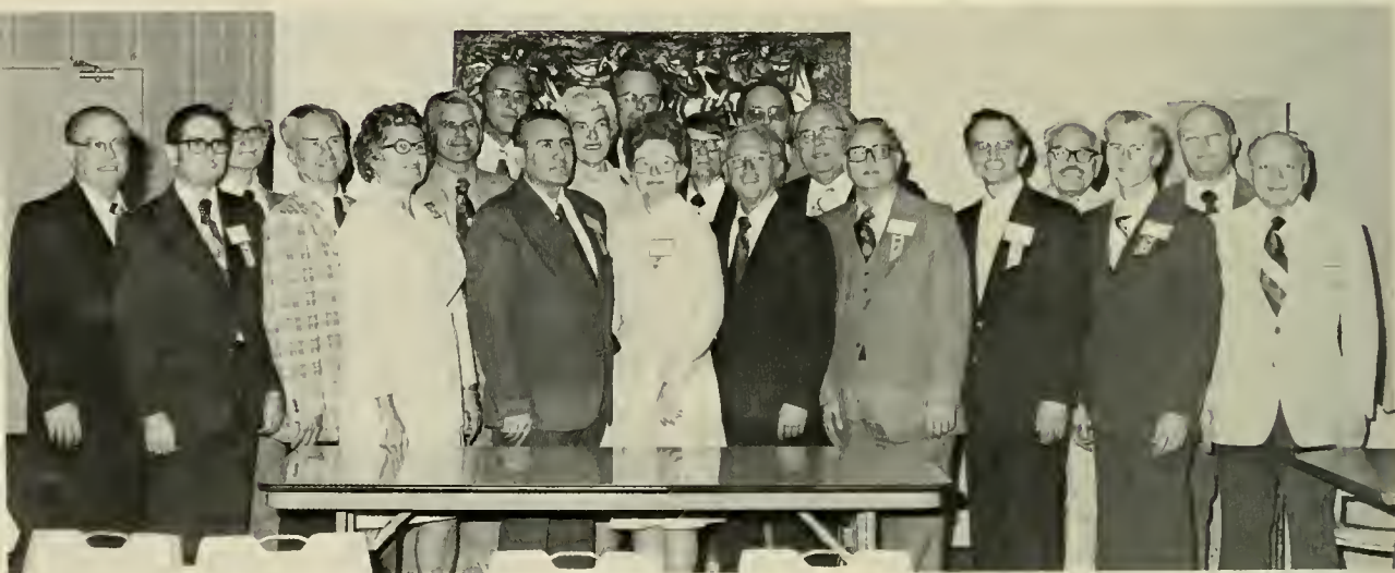
Class of 1951