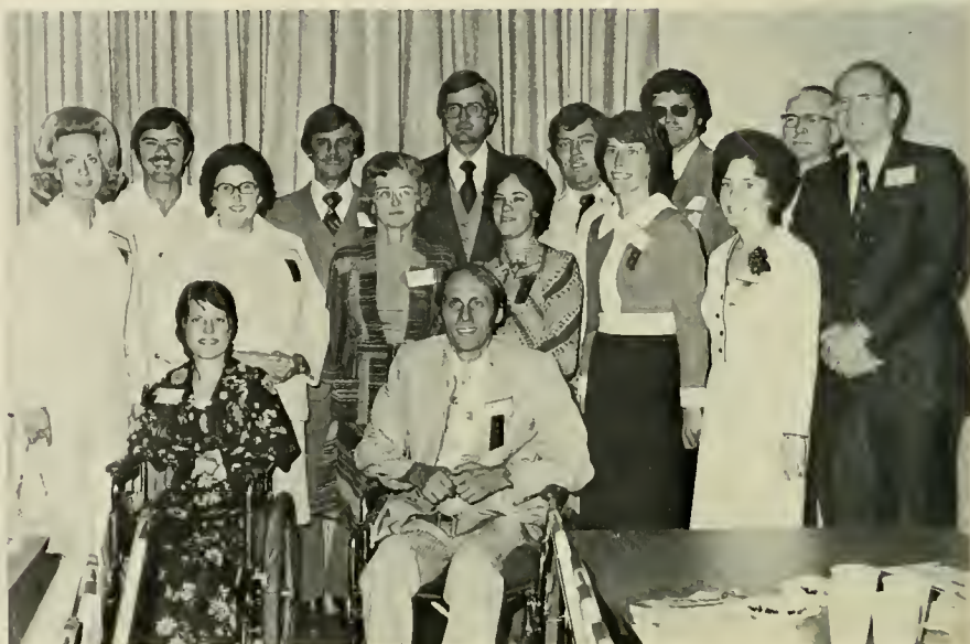
Class of 1966