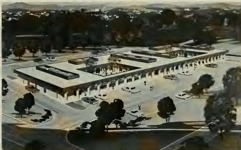
The architect's drawing of the proposed Medical Arts Center. Half of this building is completed and is being used at the present time.

A mechanism for bringing this into reality was found in the Southern Adventist Health and Hospital System, an organization formed within the Southern Union Conference of Seventh-day Adventists. This organization is presently operating the 14 hospitals in the Southern Union and agreed to take over the development of the medical office building. This building is now completed for the most part and is occupied by three physicians, three dentists, an optometrist, and a full-fledged pharmacy.