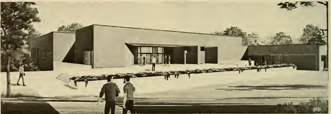
The Art Department Building and Exhibition Hall.