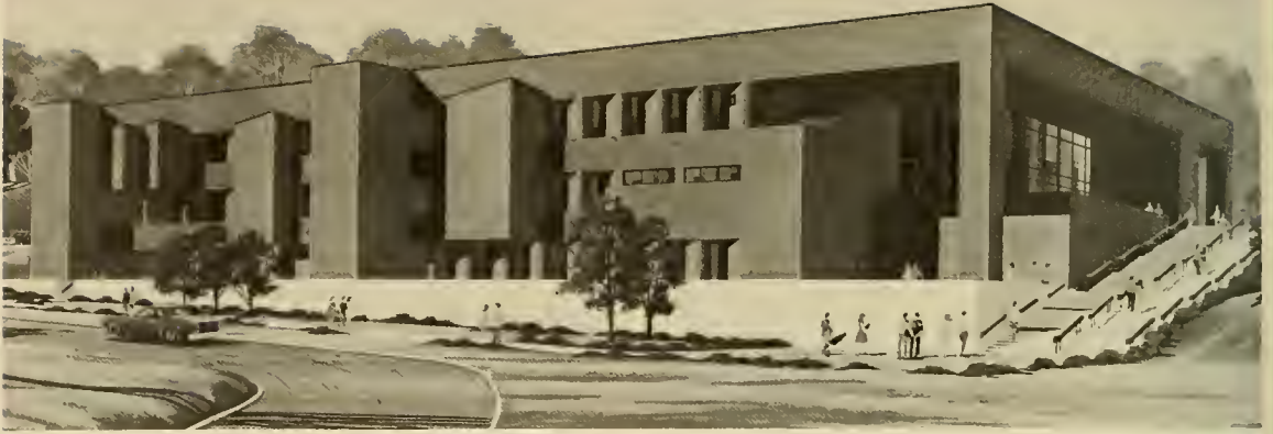
The Music Building