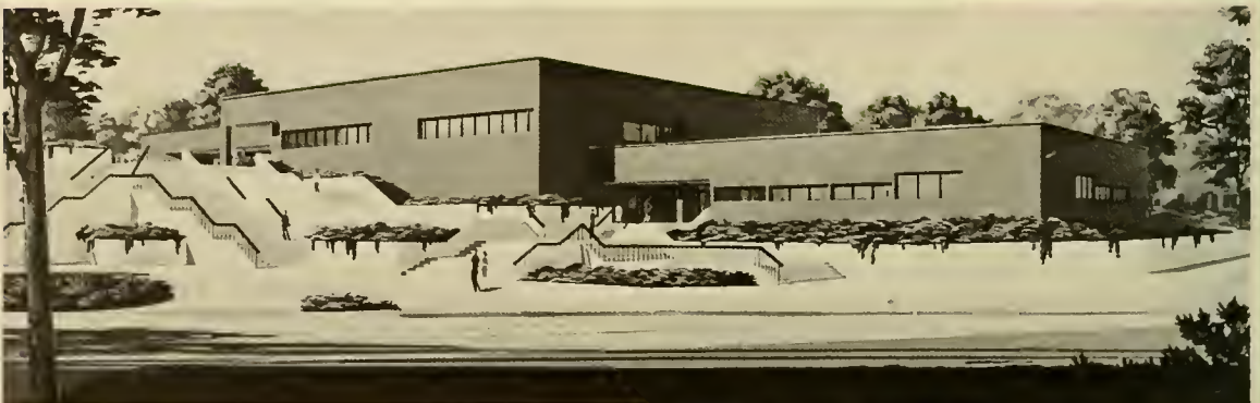
The Communication Building on the left, and the WSMC-FM radio station attached on the right.