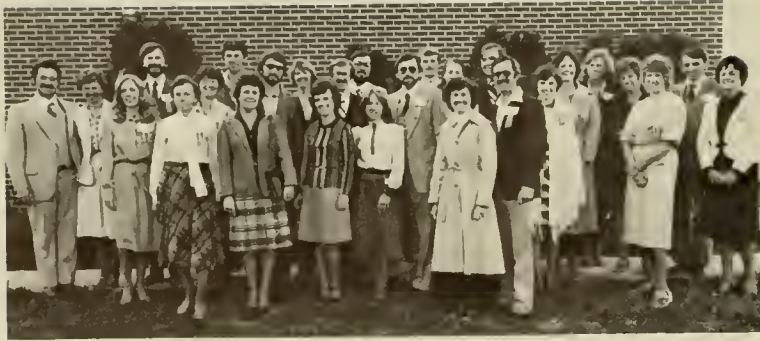
The Honor Class of 1970 poses for the photographer.