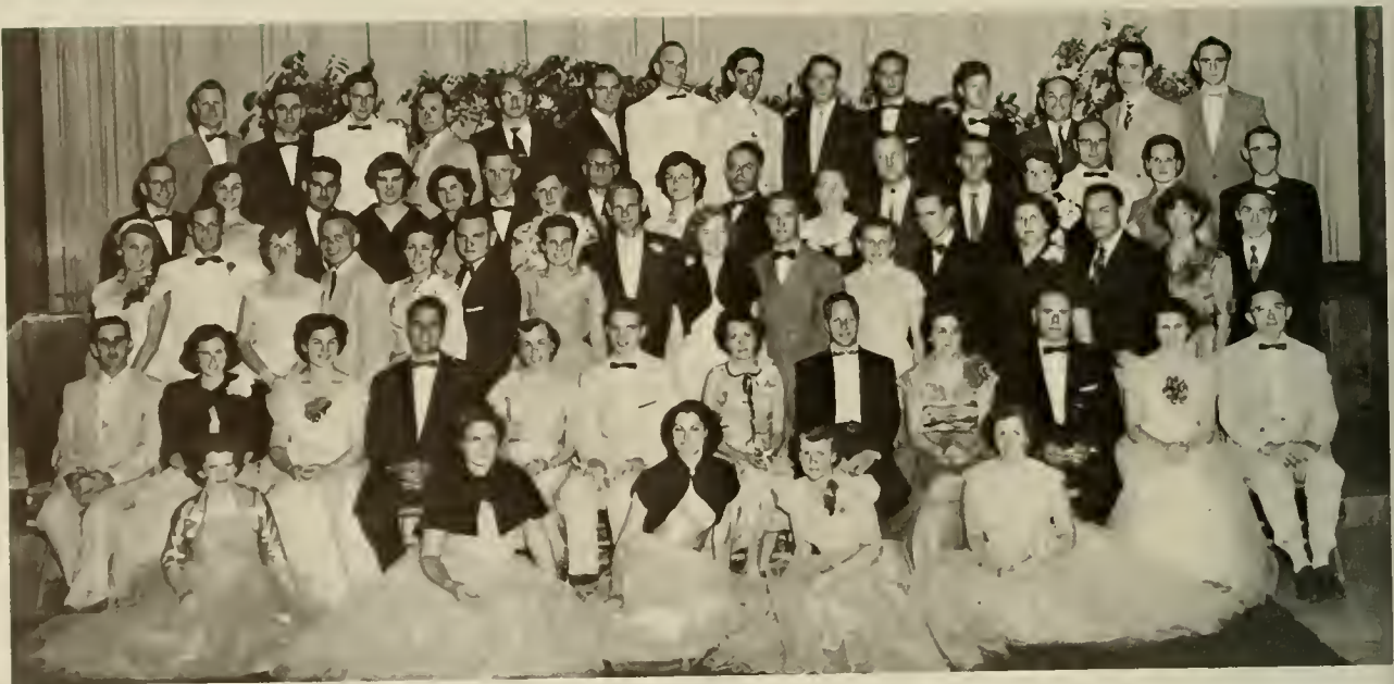
The Honor Class of 1955 — THEN