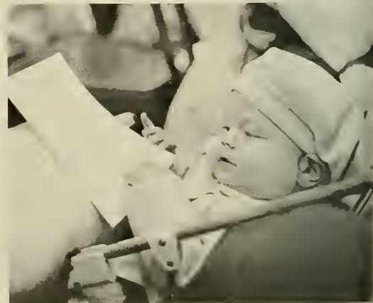
A future alumnus is intrigued by the program.