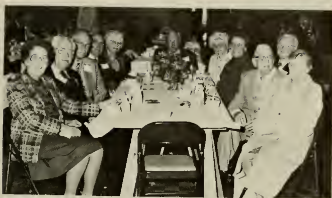
Other class members from the 1920's and 30's get together for fellowship.