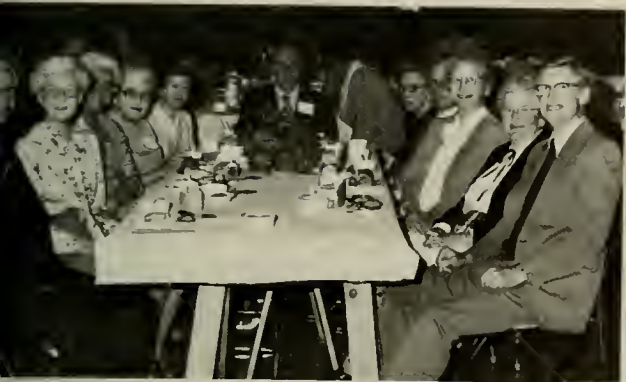
Class members and attendees from the 1920's and 30's enjoy the Sabbath evening buffet.