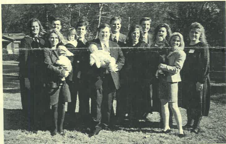
Class of 1988 - taken at the latest reunion by S.A.M.