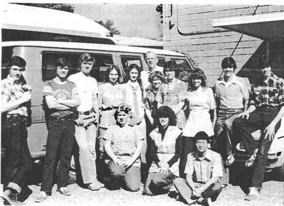
Class of 1980 (I just came across this one!)

It stands apart In darkness, No fancy lights to decorate It's form.