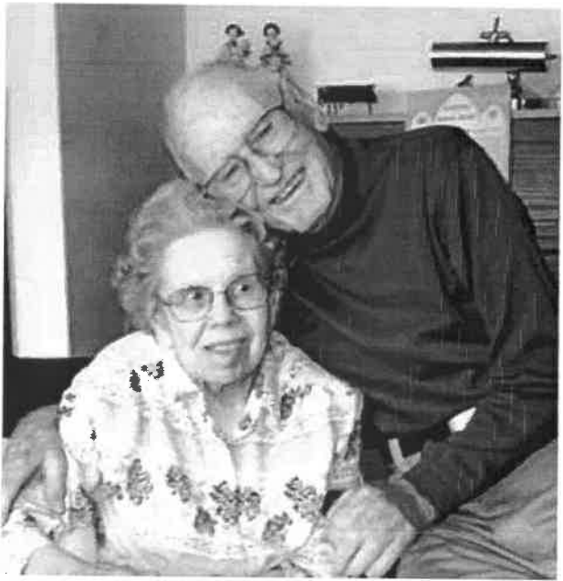
Celebrating their 73<sup>rd</sup> wedding anniversary on Sept. 3, 2006