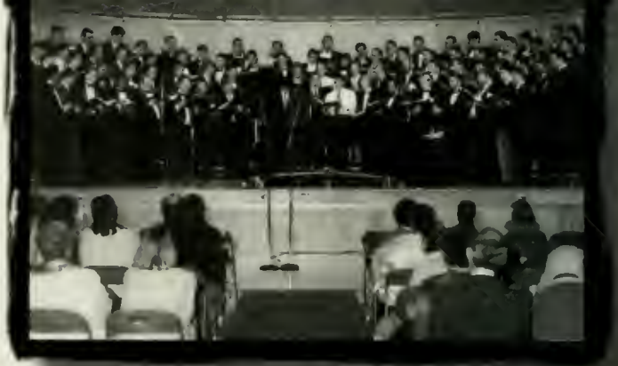
Die Meistersinger reunion chorus brought together some of the finest male voices to have graced the halls of Southern over the past 23 years