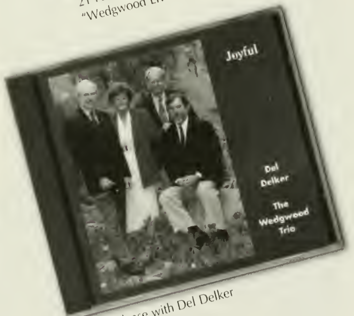
The re-release with Del Delker

All selections are available in double length CD ($15.00) or cassette tape ($10.00)