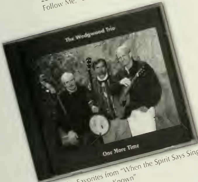
22 Secular Favorites from "When the Spirit Says Sing," and "If the Truth were Known"