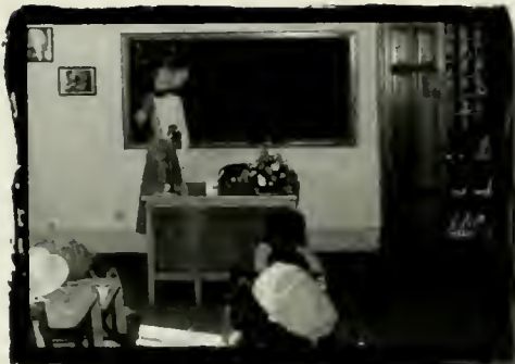
Classroom scene at the Heritage Museum in Lynn Wood Hall