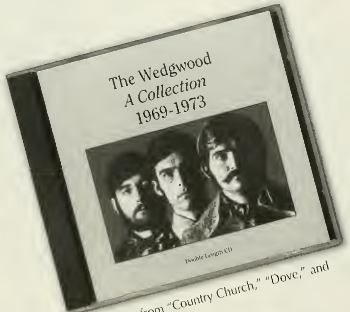
21 Favorites from "Country Church," "Dove," and "Wedgwood Live"