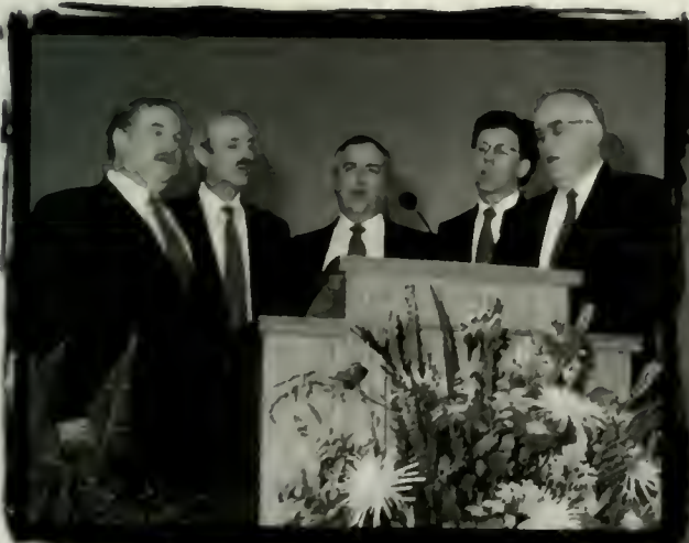
The Kettering Quintet