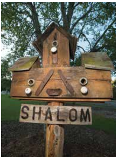
Having a “Shalom” birdhouse in your city, such as this one on public property at the four-way stop leaving campus, is a small but telling indicator that community leaders are thinking about issues of peace and sustainability.

At the risk of oversimplifying the ideas, embedded in the term “sustainable development” are two concepts: 1) caring for the Earth in such a way that both present and future generations can benefit from its bounty while justice is preserved (sustainable); and 2) the wise use of resources for the purpose of