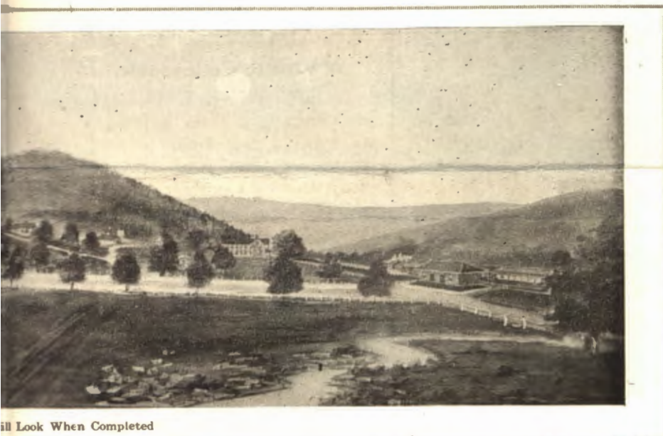
Will Look When Completed

.....11:15-11:30 .....11:30-12:00 .....12:00-12:45 Study Hour.....12:45- 2:00 First Class..... 2:00- 2:45 Second Class..... 2:45- 3:30 Third Class ..... 3:30- 4:15 Fourth Class..... 4:15- 5:00 ..... 6:00 ..... 6:45 ..... 7:00- 9:15 ..... 9:15- 9:30 ..... 9:30